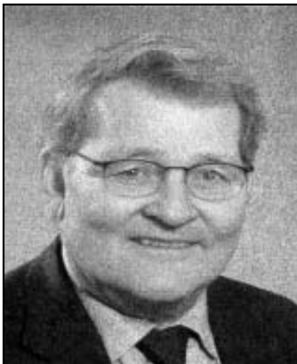
Former Foreign Minister Petersen of Denmark

The DSLPP also suggests a shift in International Law to focus on individual rights instead of state sovereignty. In addition, the DSLPP suggests that the UN: